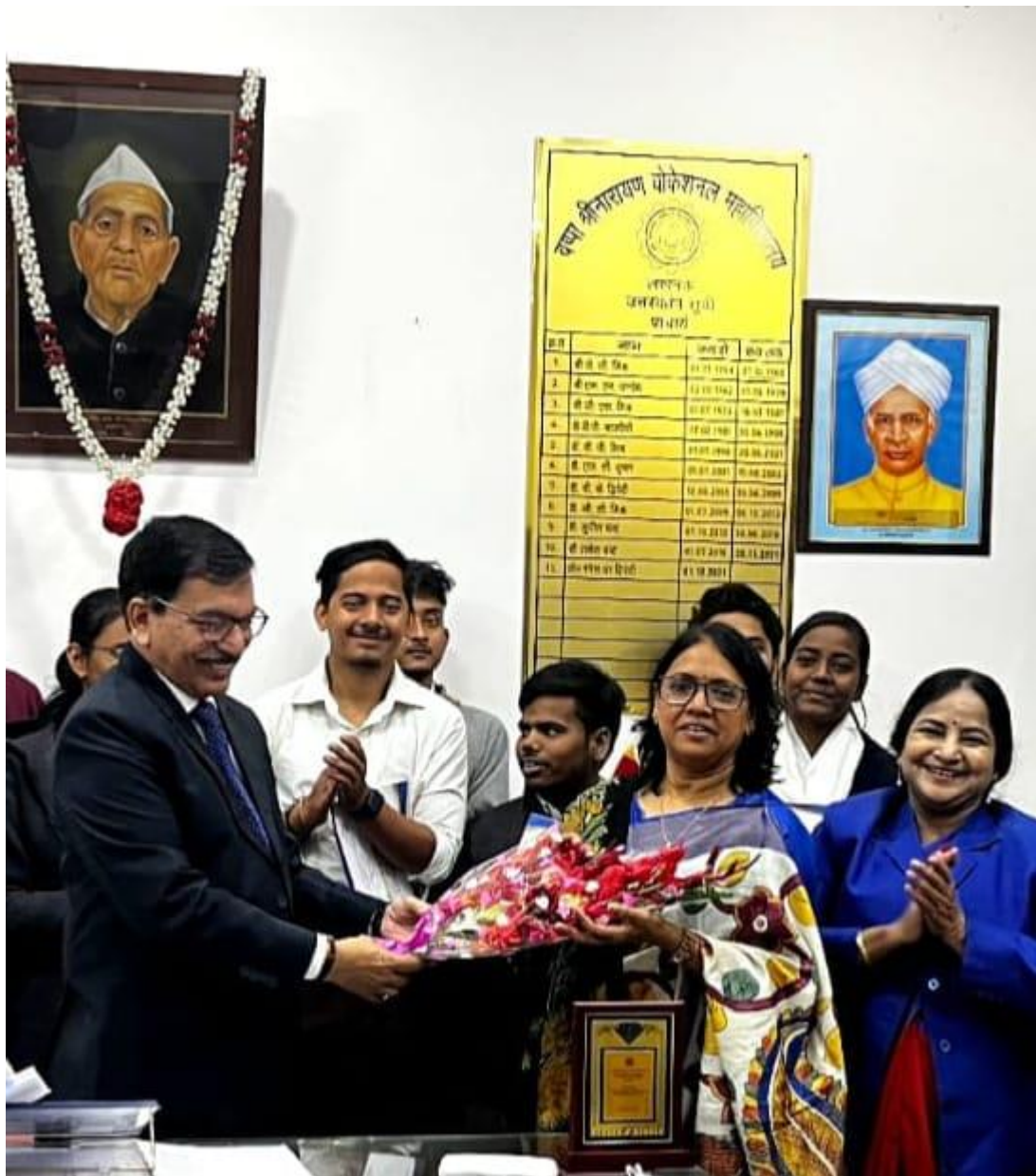
(Head) Department of English